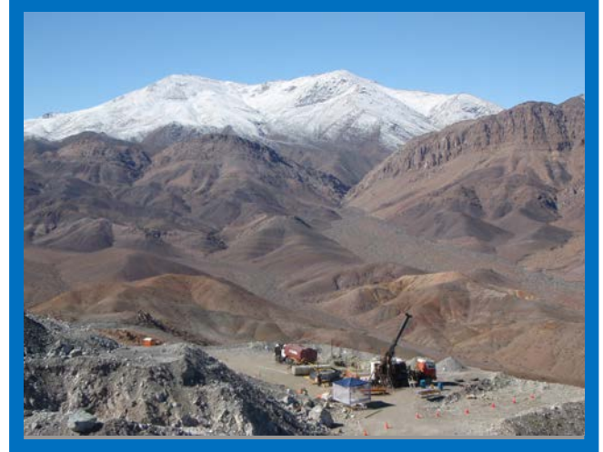
Diamond drilling, Rosario Cu-Au Project, Region III, Chile